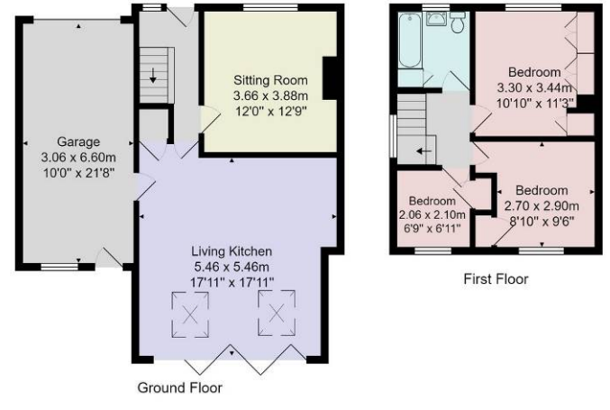
Total Area: 107.3 m² ... 1155 ft² All measurements are approximate and for display purposes only. No liability is accepted by either the agency or Box Property Solutions Ltd as to the exact measurements of the rooms. Box Property Solutions Ltd retains the copyright on this plan and allows agents to use it with agreed permission.