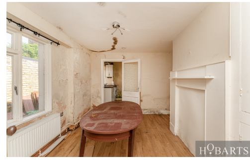
46 Lancaster Road, Stroud Green, London, N4