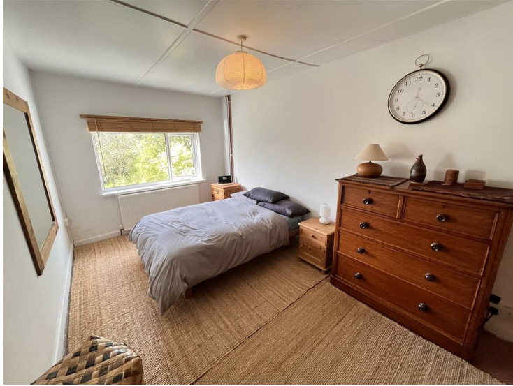
Radiator, front window