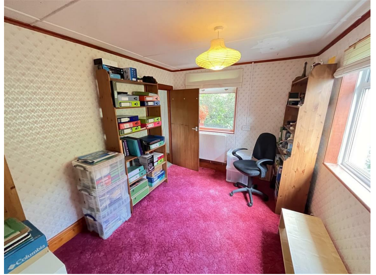
Radiator, rear and side windows