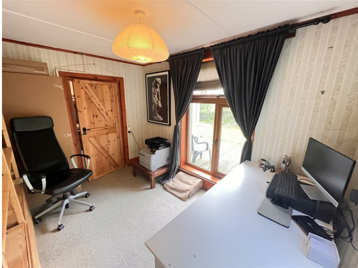
Radiator, front and side windows, interconnection to bedroom 3