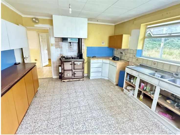
Kitchen/Dining Room 15'6 x 12' (4.72m x 3.66m)

A large room with tiled floor and base units, Rayburn range with back boiler that operates the central heating and hot water systems and also provides cooking facilities.