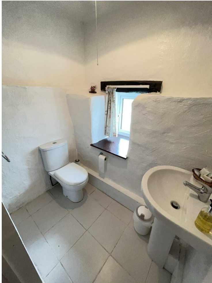
Ensuite shower room