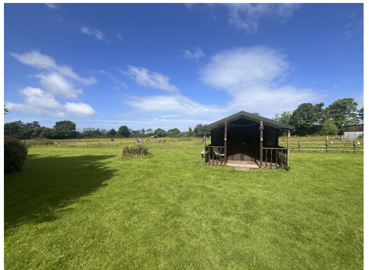
To the front of the house are extensive lawned gardens with a raised, decked terrace currently having a hot tub and front