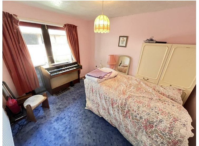
Bedroom 2 11 x 9'6 (3.35m x 2.90m)