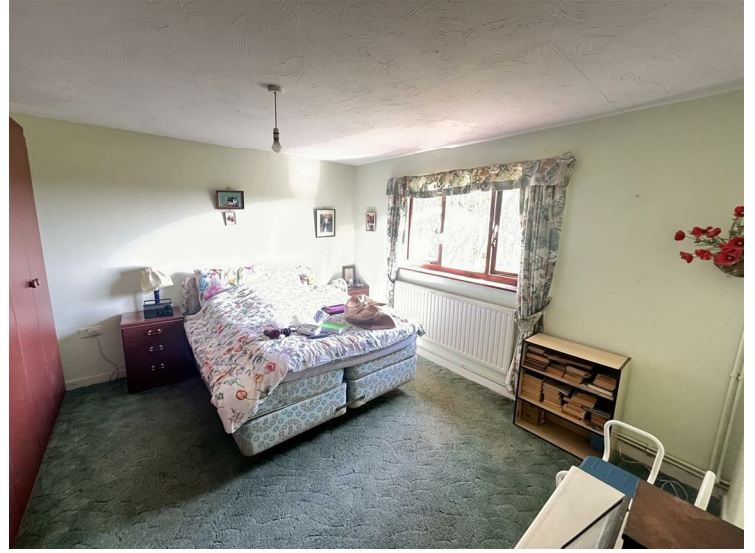
Front bedroom 1 12'7 x 11'10 (3.84m x 3.61m)