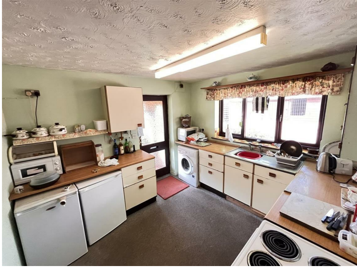
Kitchen 10'5 x 10 (3.18m x 3.05m)

With range of basic units at base and wall level incorporating single drainage sink unit, electric cooker point, access to airing cupboard housing oil-fired central heating boiler.