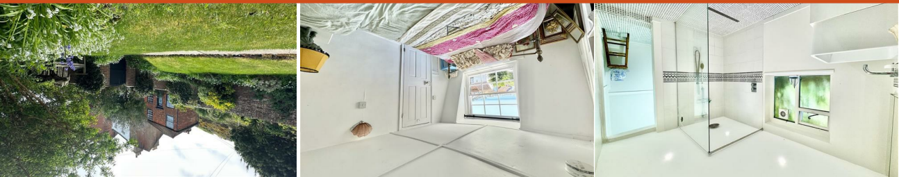
21 Woods Passage, Old Town, Hastings, TN34 3BX