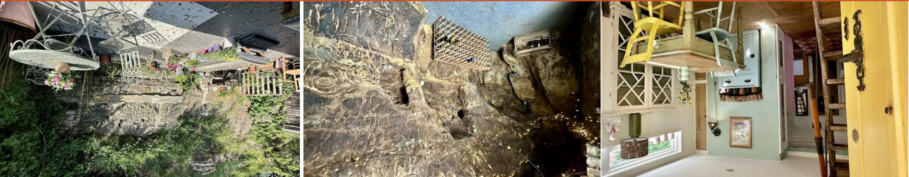
6 Castle Cliff Cottages, Hastings, TN34 3RG

While every attempt has been made to ensure the accuracy of the floorplan contained here, measurements of doors, windows, rooms and any other items are approximate and no responsibility is taken for any error, omission or mis-statement. This plan is for illustrative purposes only and should be used as such by any prospective purchaser. The services, systems and appliances shown have not been tested and no guarantee as to their operability or efficiency can be given. Made with Metropix 2.025