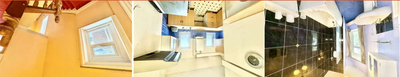
First Floor Flat 155 Priory Road, Hastings, TN34 3JD