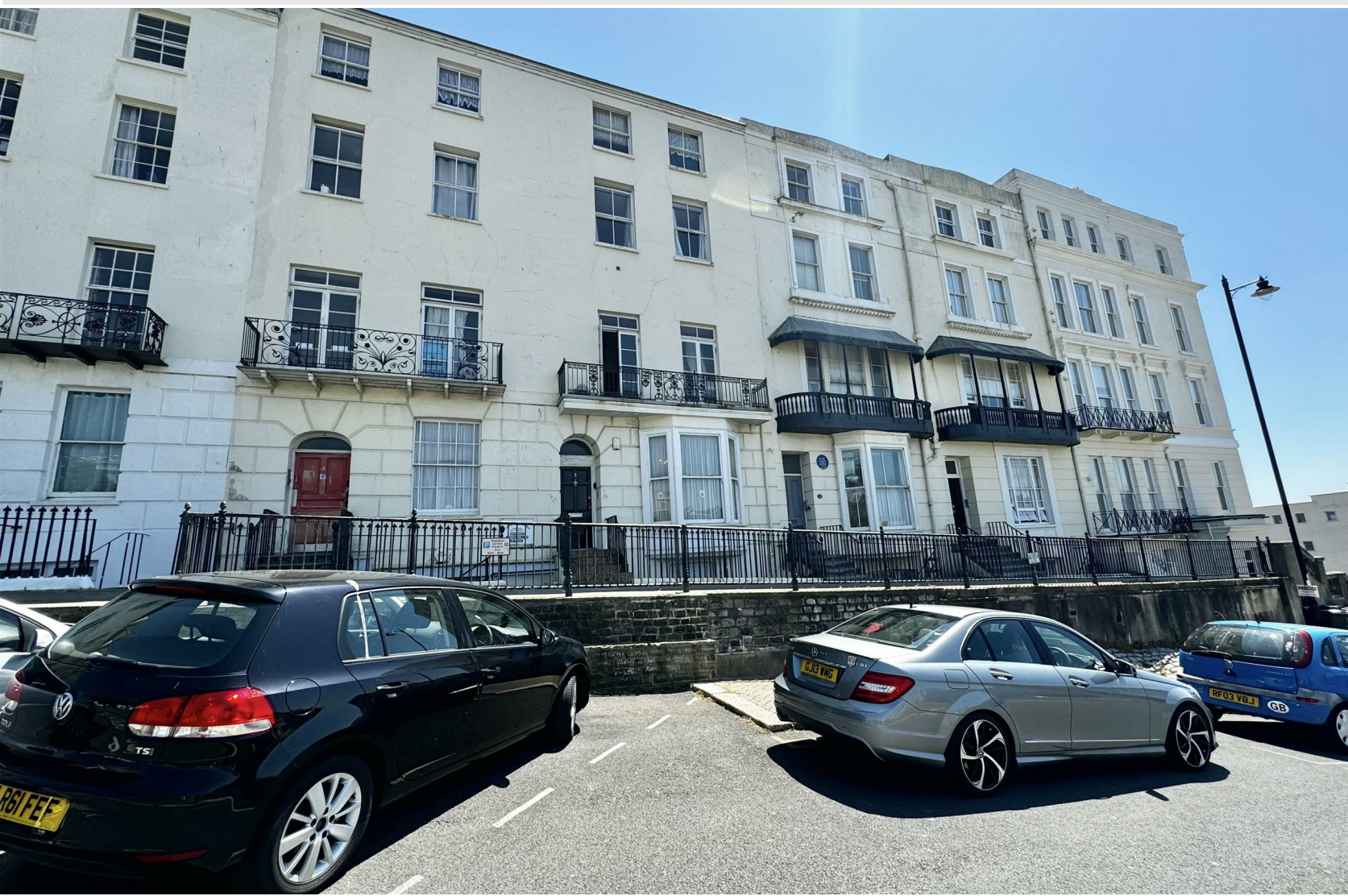
Ground Floor Flat 3 Wellington Square, Hastings, TN34 1PB