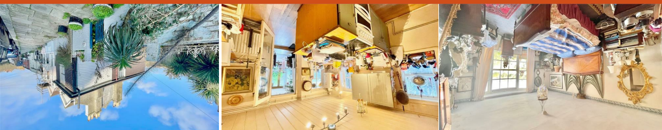
Strawberry Cottage 36 Tackleway, Old Town, Hastings, TN34 3BU