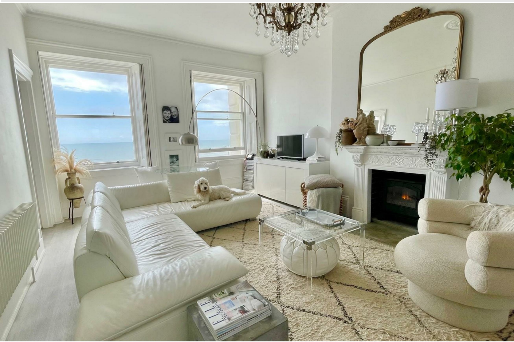
Flat 3 98 Marina, St. Leonards-on-Sea, TN38 0BP