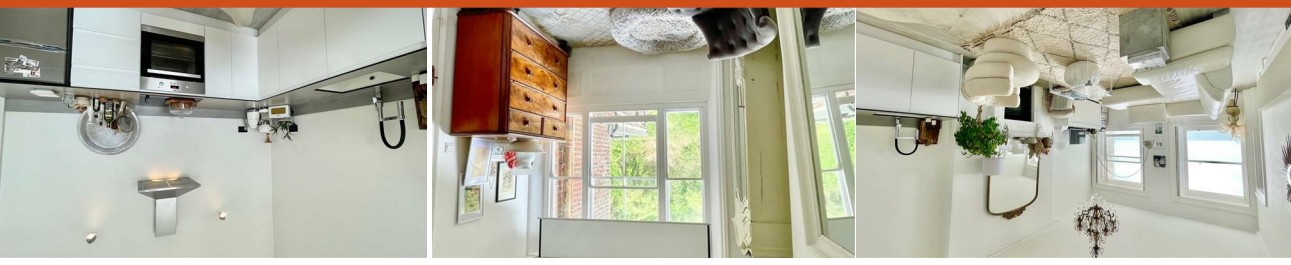
Flat 3 98 Marina, St. Leonards-on-Sea, TN38 0BP