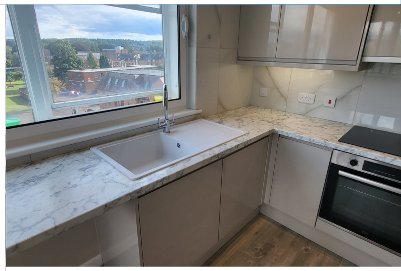
Priced to sell £139,000