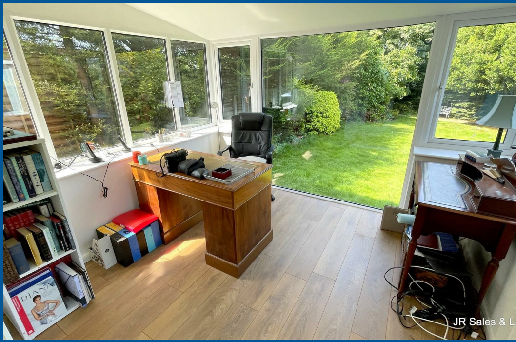
JR Sales & L