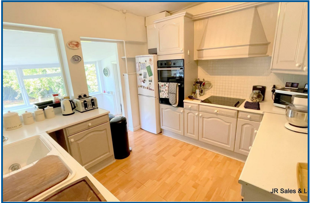
JR Sales & L