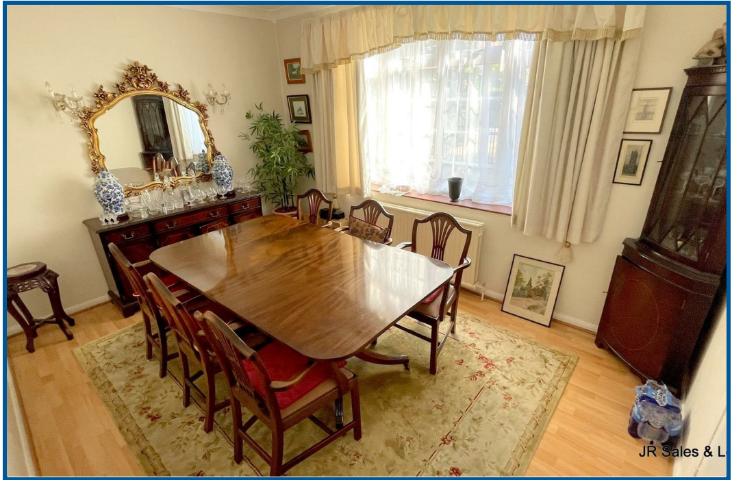
JR Sales & L