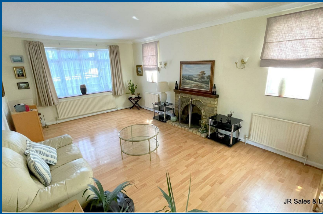
JR Sales & L