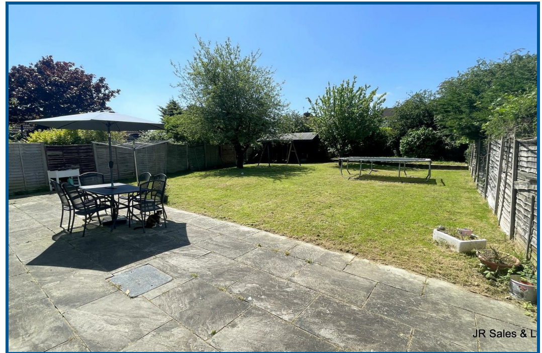
JR Sales & L