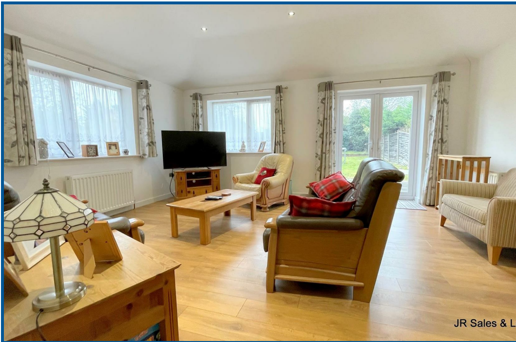
JR Sales & L