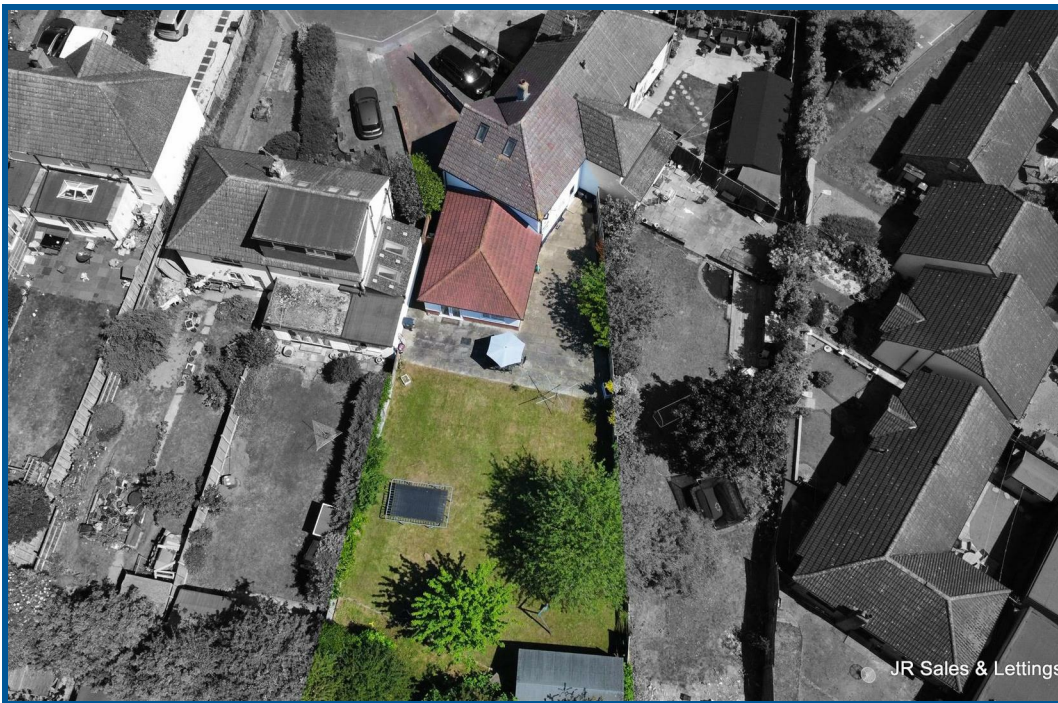
JR Sales & Lettings