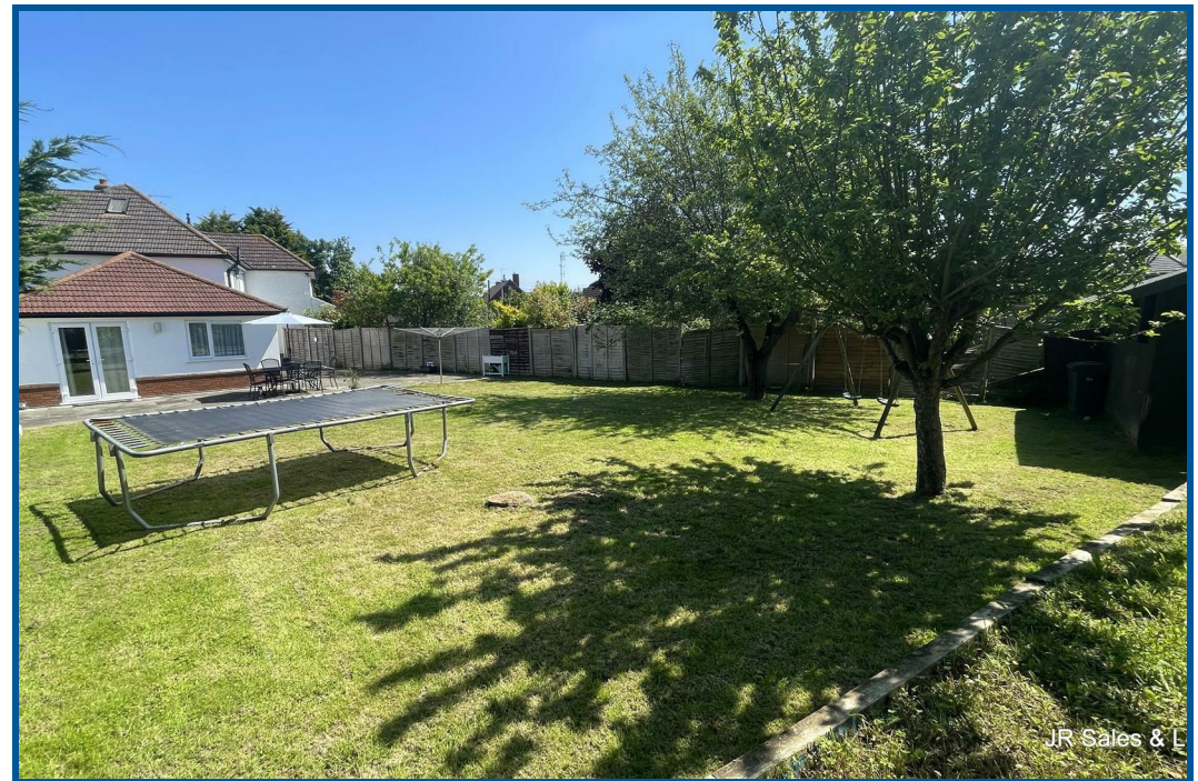
JR Sales & L