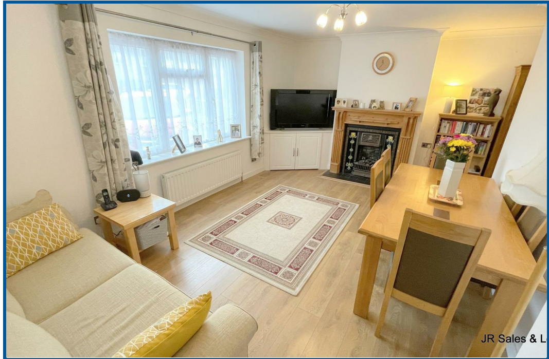
JR Sales & L