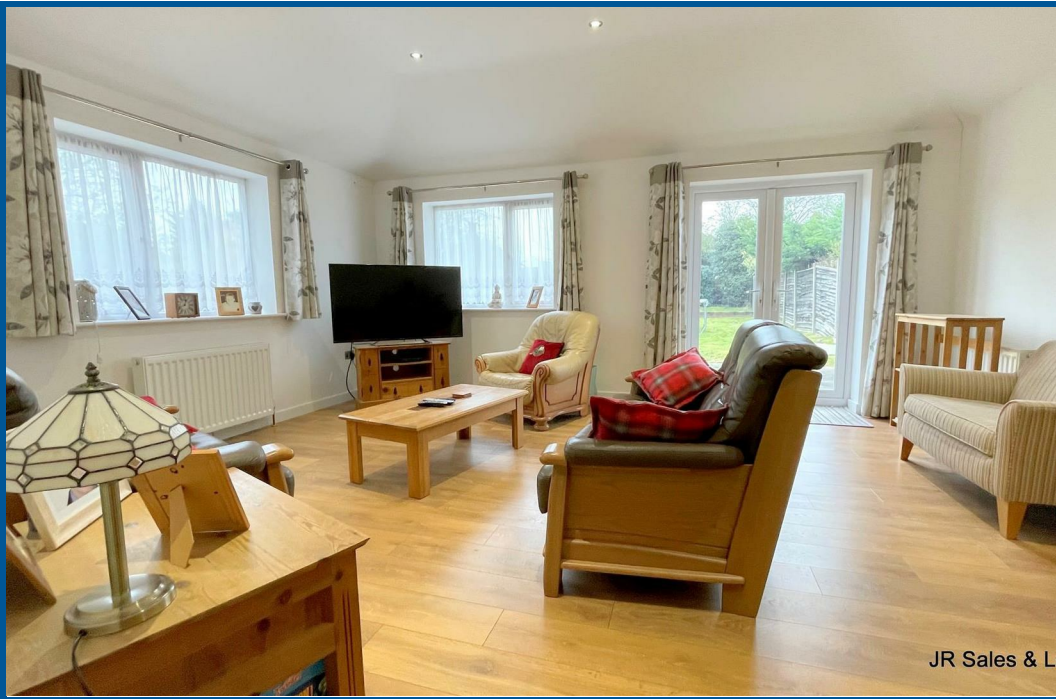
JR Sales & L