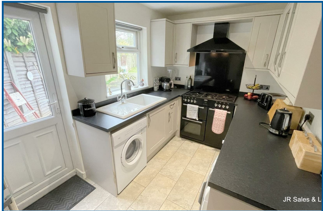
JR Sales & L