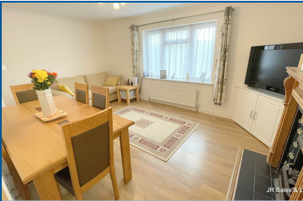
JR Sales & L