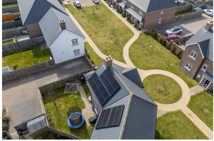
Book a Viewing

01243 861344 Sales@ClarkesEstates.co.uk 27 Sudley Road, Bognor Regis, PO21 1EW http://www.clarkesestates.co.uk