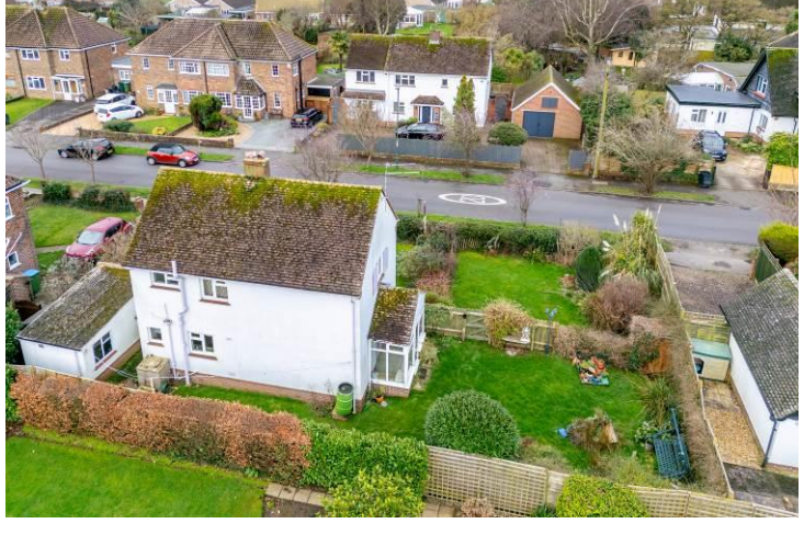
Book a Viewing

01243 861344 Sales@ClarkesEstates.co.uk 27 Sudley Road, Bognor Regis, PO21 1EW http://www.clarkesestates.co.uk