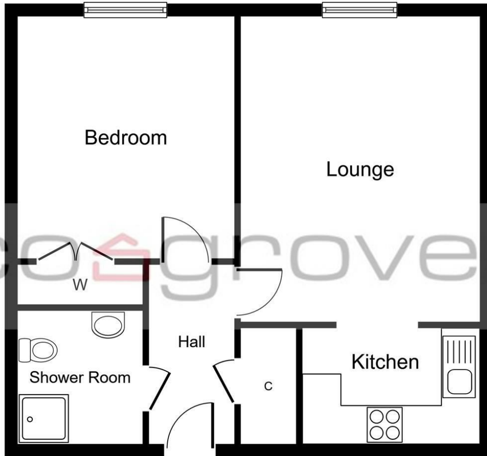
Homegrove House, Grove Road North, Southsea, PO5 1HW

Whilst every attempt has been made to ensure the accuracy of the floor plan contained here, measurements of doors, windows, rooms and any other items are approximate and no responsibility is taken for any error, omission, or mis-statement. The measurements should not be relied upon for valuation, transaction and/or funding purposes. This plan is for illustrative purposes only and should be used as such by any prospective purchaser or tenant.