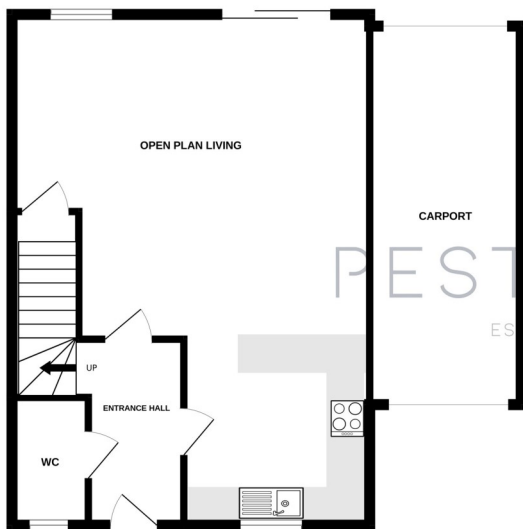
GROUND FLOOR 688 sq.ft. (63.9 sq.m.) approx.