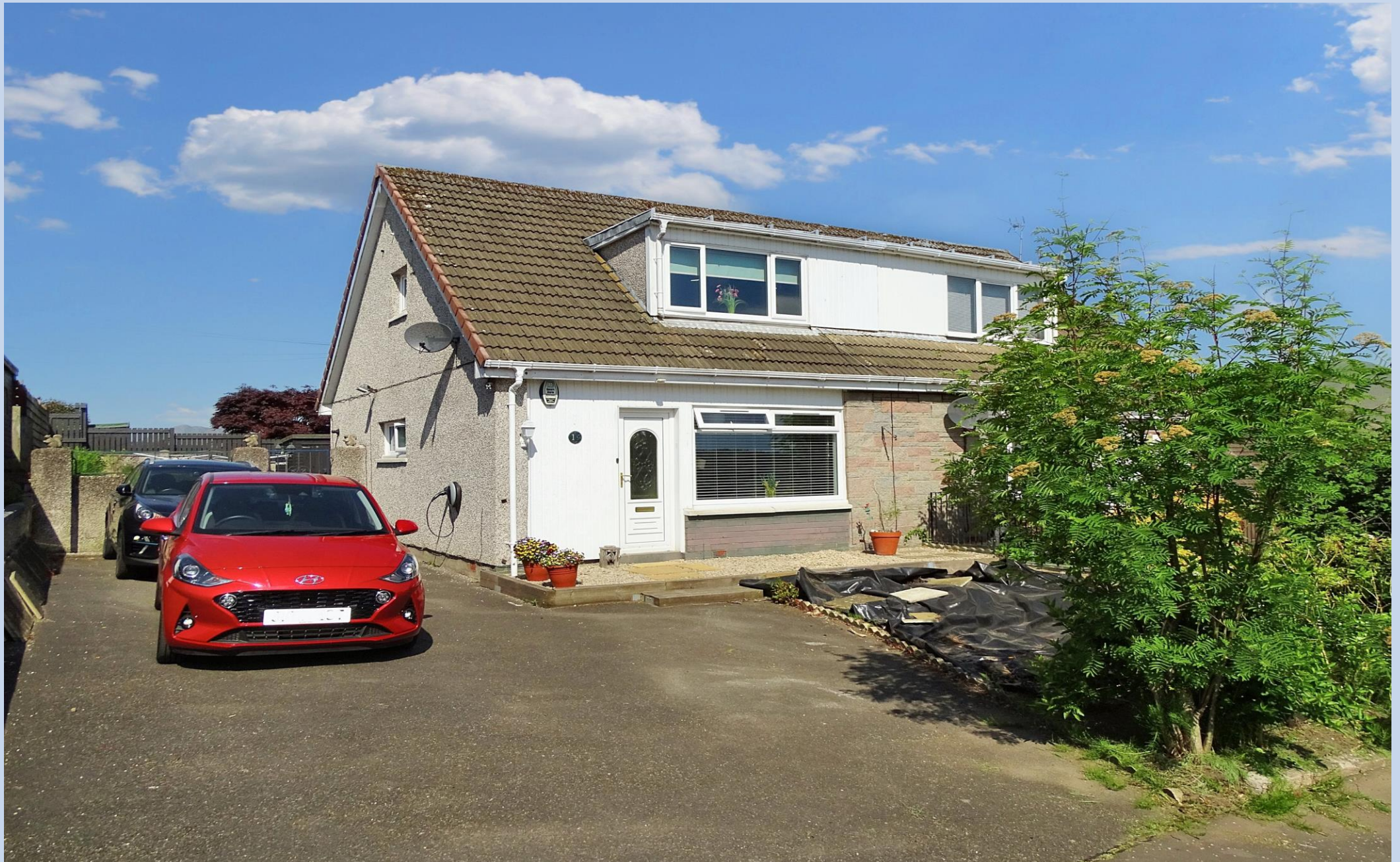
1, The Rowans, Sauchie Clackmannanshire FK10 3EU