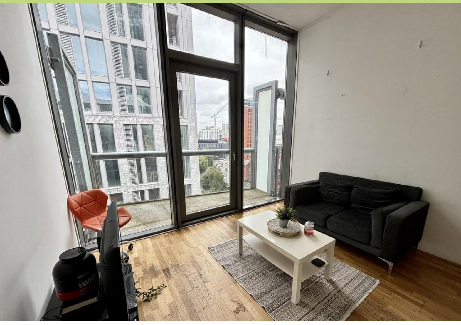
Abito, Greengate, Manchester - Asking Price Of £115,000

Julie Twist Properties welcome to the market this eighth floor apartment located in Abito in Greengate. Abito is made up entirely of studio apartments, all of which are very cleverly designed and make fantastic use of the space available. The apartment comprises an open plan living area with a kitchenette, which has doors opening to a private balcony. The central pod becomes the hub of each apartment and contains plenty of storage space, as well as a three-piece bathroom. This acts as a partition between the living space and the bedroom area.