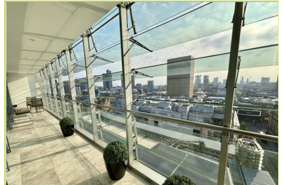
9TH FLOOR 2198 sq.ft. (204.2 sq.m.) approx.