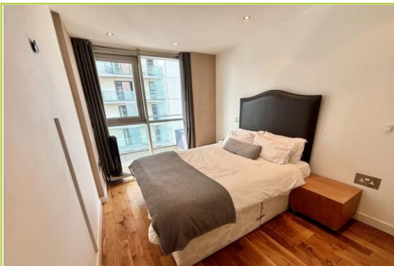
15TH FLOOR 724 sq.ft. (67.3 sq.m.) approx.