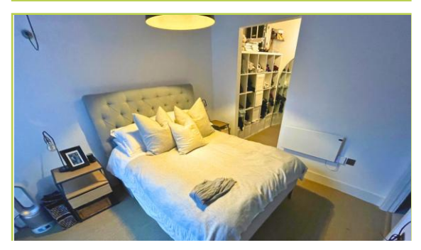
1266 sq.ft. (117.6 sq.m.) approx.