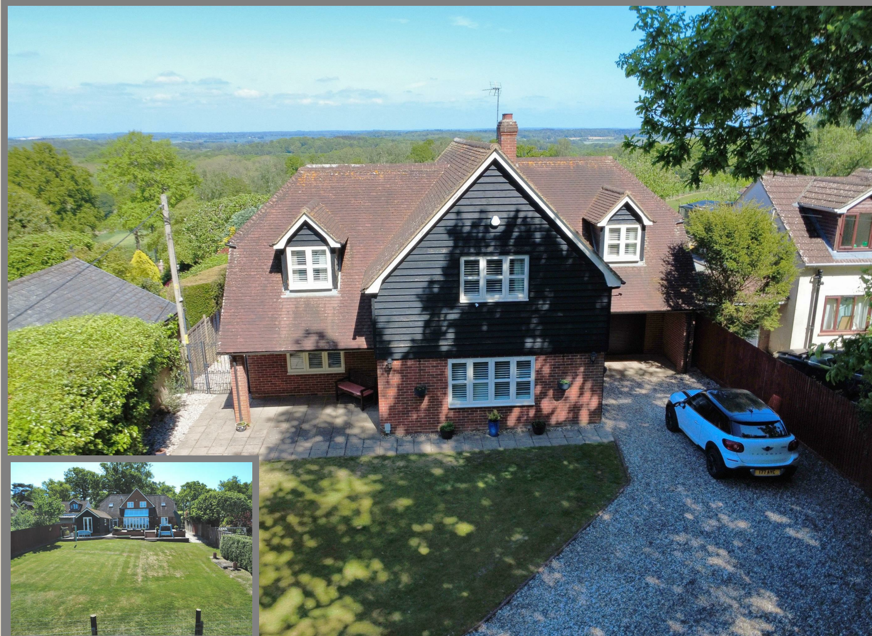
Oak House, The Ridge, Cold Ash, RG18 9HX