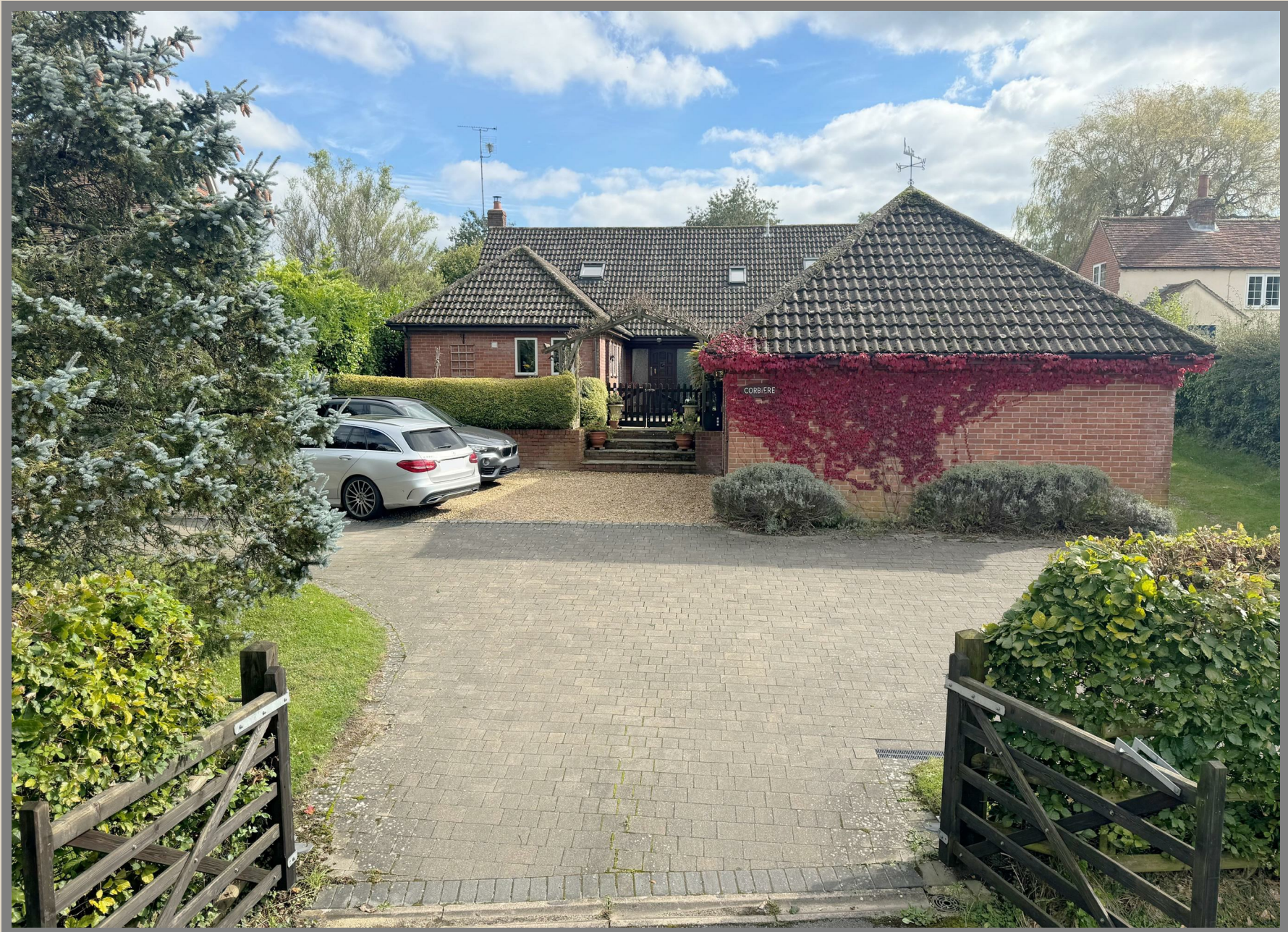
CORBIERE , Blandys Hill, Kintbury, RG17 9UE