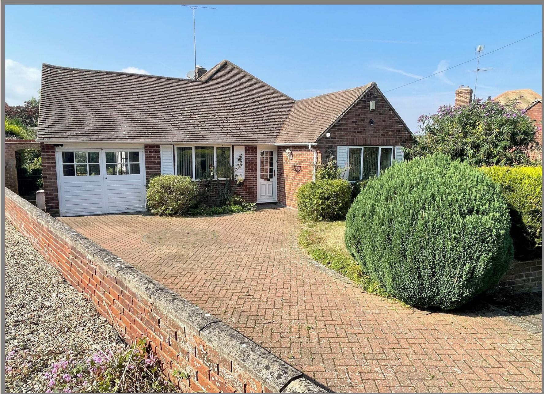
Hill Crest, Falkland Drive, Newbury, RG14 6JQ