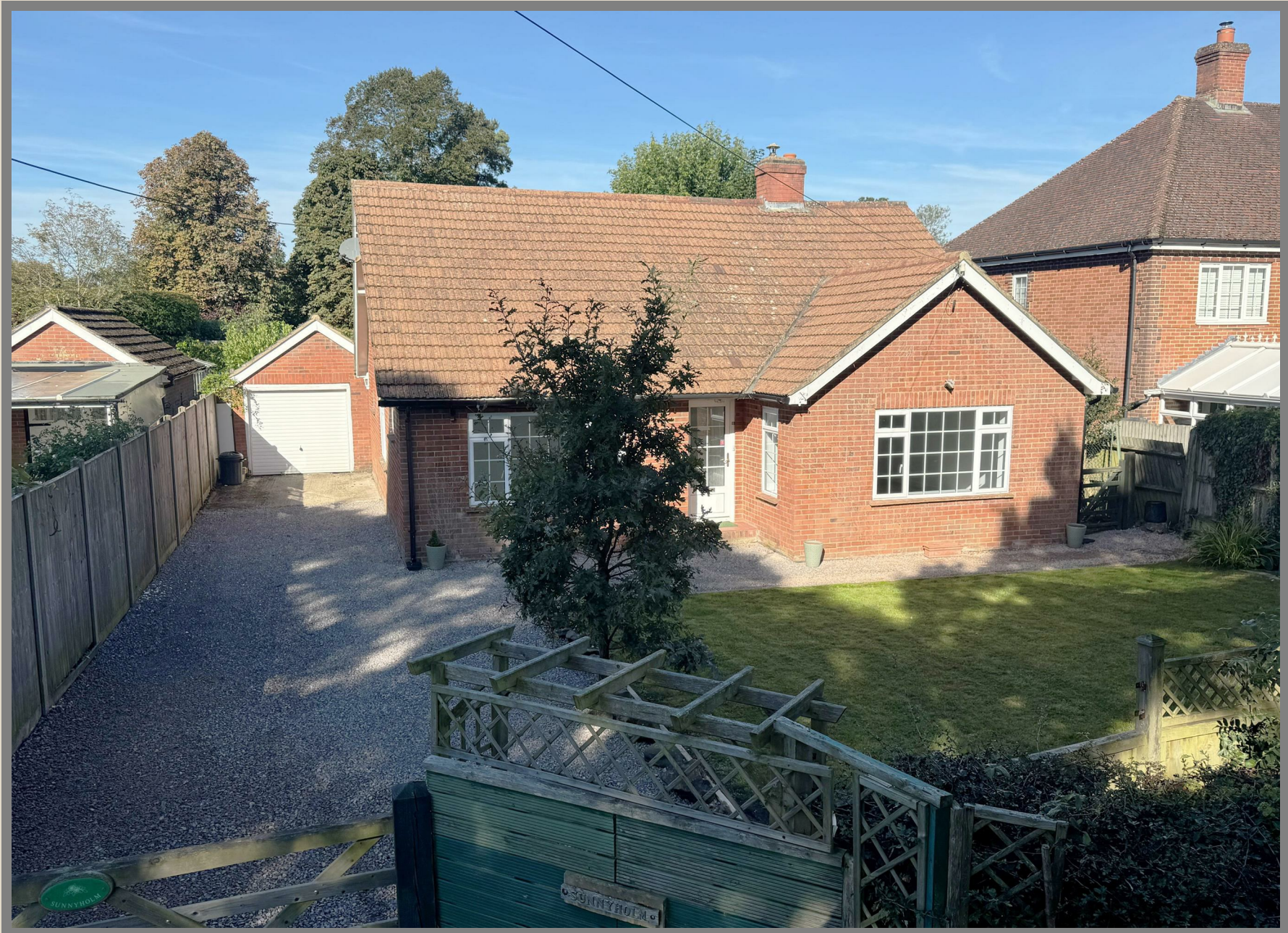
Sunnyholm, Tubbs Lane, Highclere, RG20 9PW