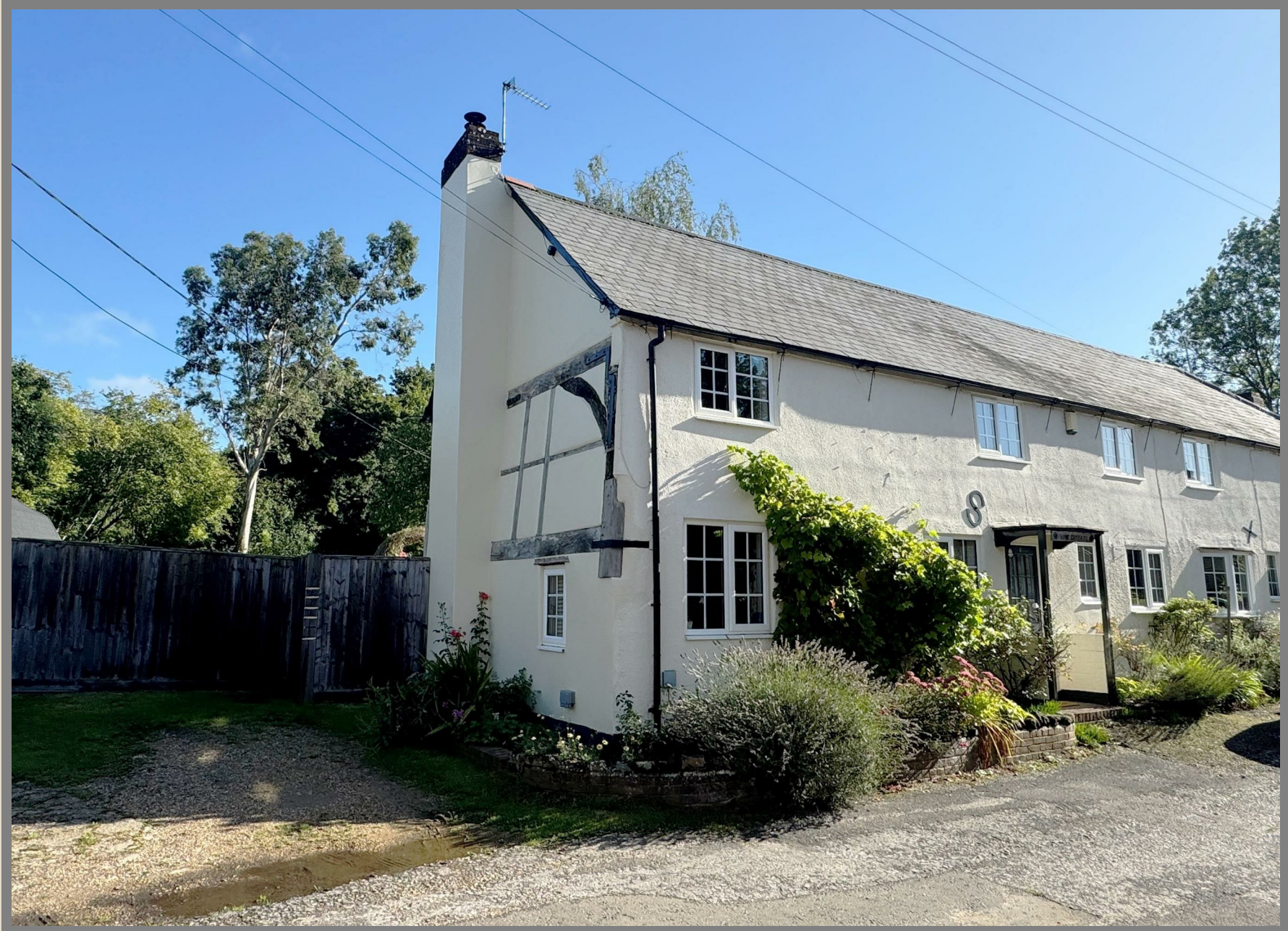
Vine Cottage, Mill Lane, Ecchinswell, RG20 4UD