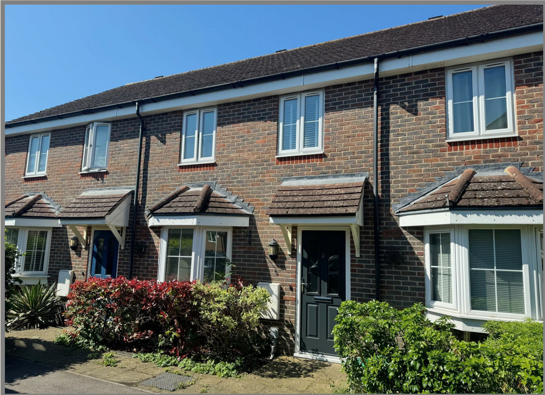
Wallis Gardens, Newbury, RG14 7SF