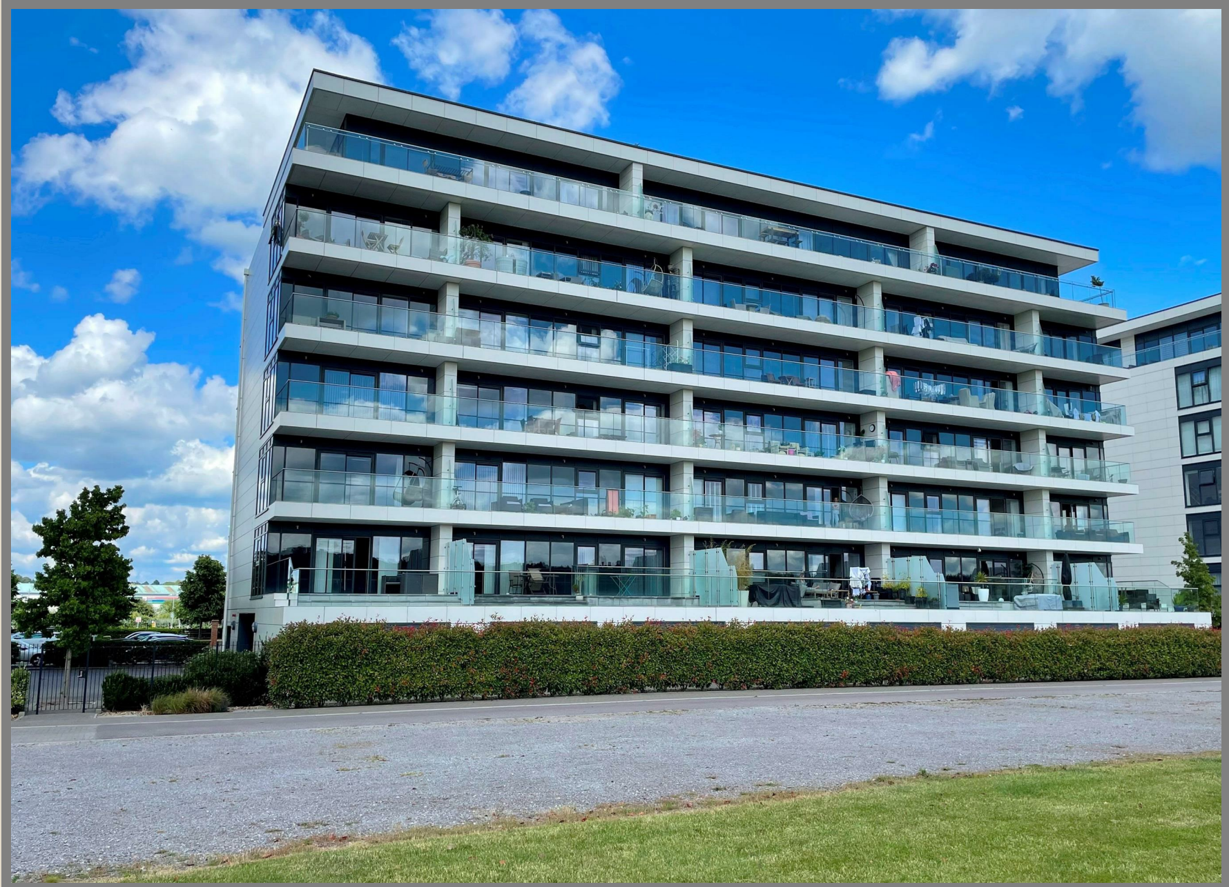
Farriers House, Farriers House, Kingman Way, Newbury, RG14 7GT