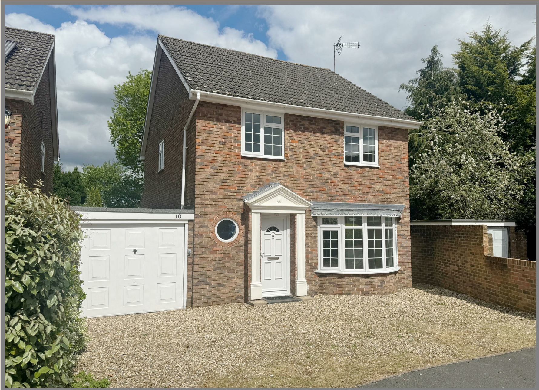
Manor Place, Speen, Newbury, RG14 1RB