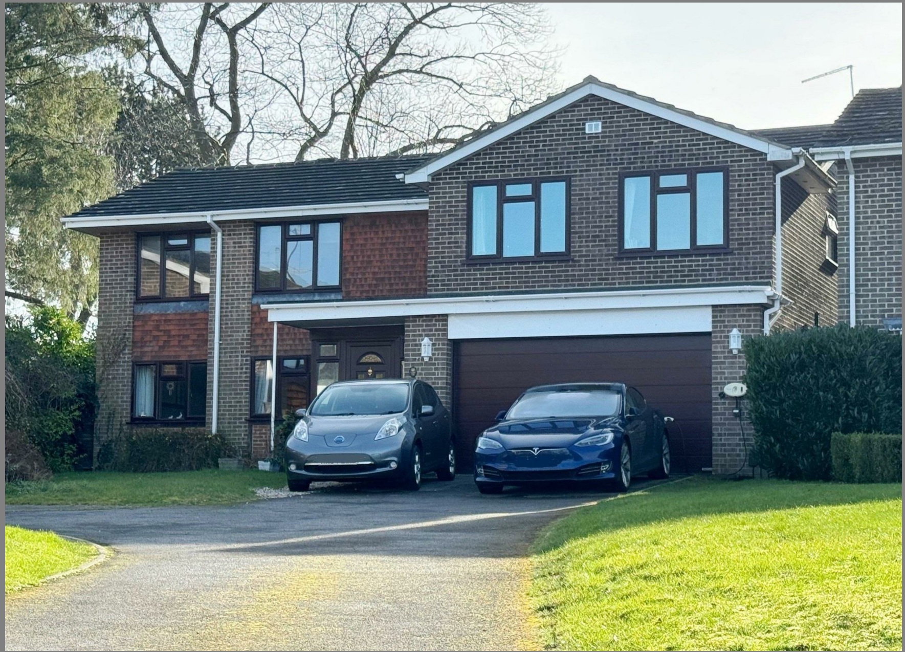
The Marlowes, Newbury, RG14 7AY