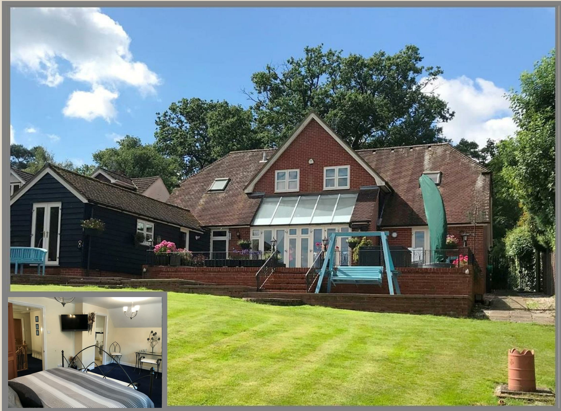
Oak House, The Ridge, Cold Ash, RG18 9HX