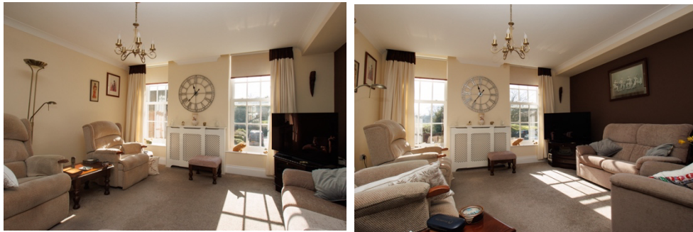
Flat S3, The Quadrangle, Hunmanby Hall, Hunmanby - continued