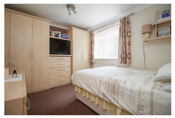
/ continued over

Fitted wardrobes and dressing table. Radiator. Upvc double glazed window.