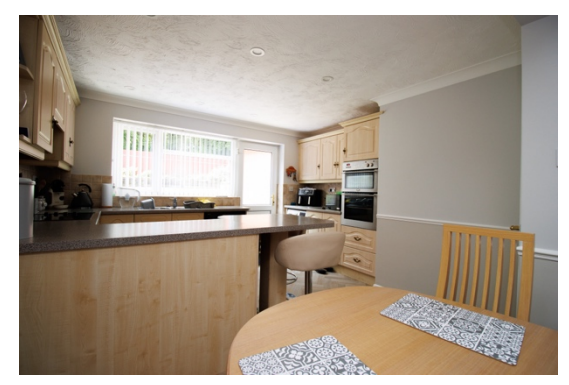
DINING KITCHEN 5.26m x 3.96m max