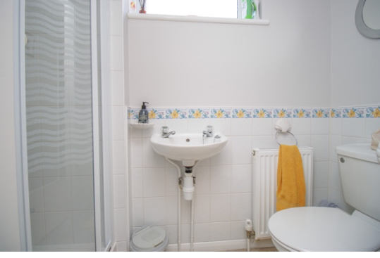
/ continued over

Shower cubicle with electric shower, handbasin and wc. Radiator. Upvc double glazed window.