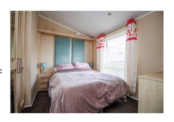
BEDROOM ONE 3.09m x 2.36m (10'2" x 7'9")

Built in wardrobe. Radiator. Upvc double glazed window.