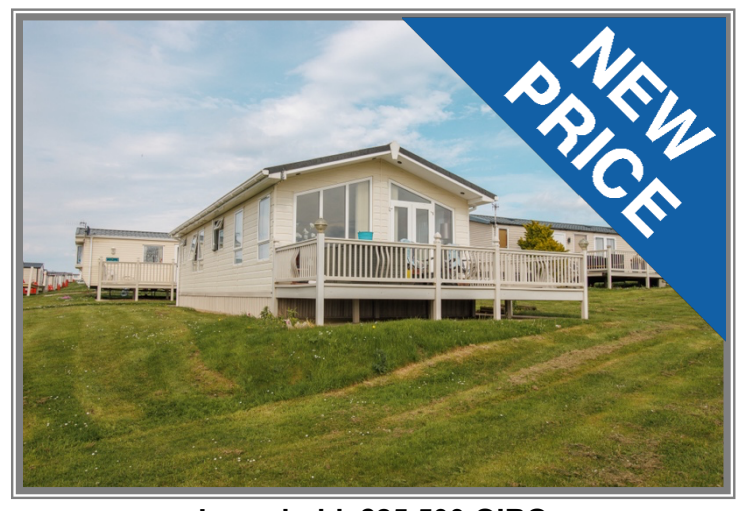
Leasehold £25,500 OIRO