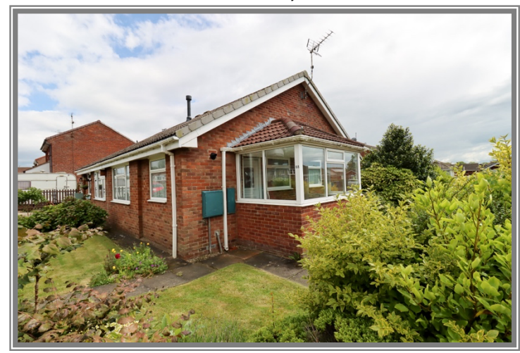
Freehold Offers Over £190,000