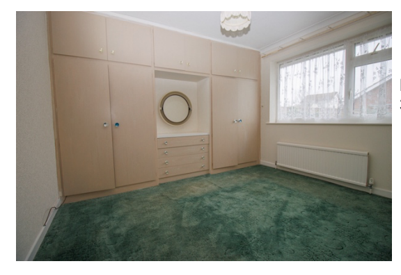
BEDROOM ONE 3.32m x 3.12m (10'11" x 10'3")

Built-in wardrobes with boxtop cupboards. Radiator. Upvc double glazed window.