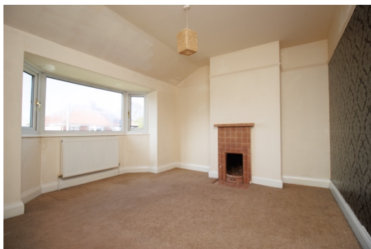
BEDROOM ONE 3.63m x 3.07m (11'11" x 10'1") plus bay.

Feature fireplace. Radiator. Upvc double glazed bay window.