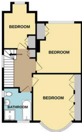
TOTAL FLOOR AREA: 1417 sq.ft. (131.7 sq.m.) approx.

Whilst every attempt has been made to ensure the accuracy of the floorplan contained here, measurements of doors, windows, rooms and any other items are approximate and no responsibility is taken for any error, omission or mis-statement. This plan is for illustrative purposes only and should be used as such by any prospective purchaser. The services, systems and appliances shown have not been tested and no guarantee as to their operability or efficiency can be given. Made with Metropix ©2024