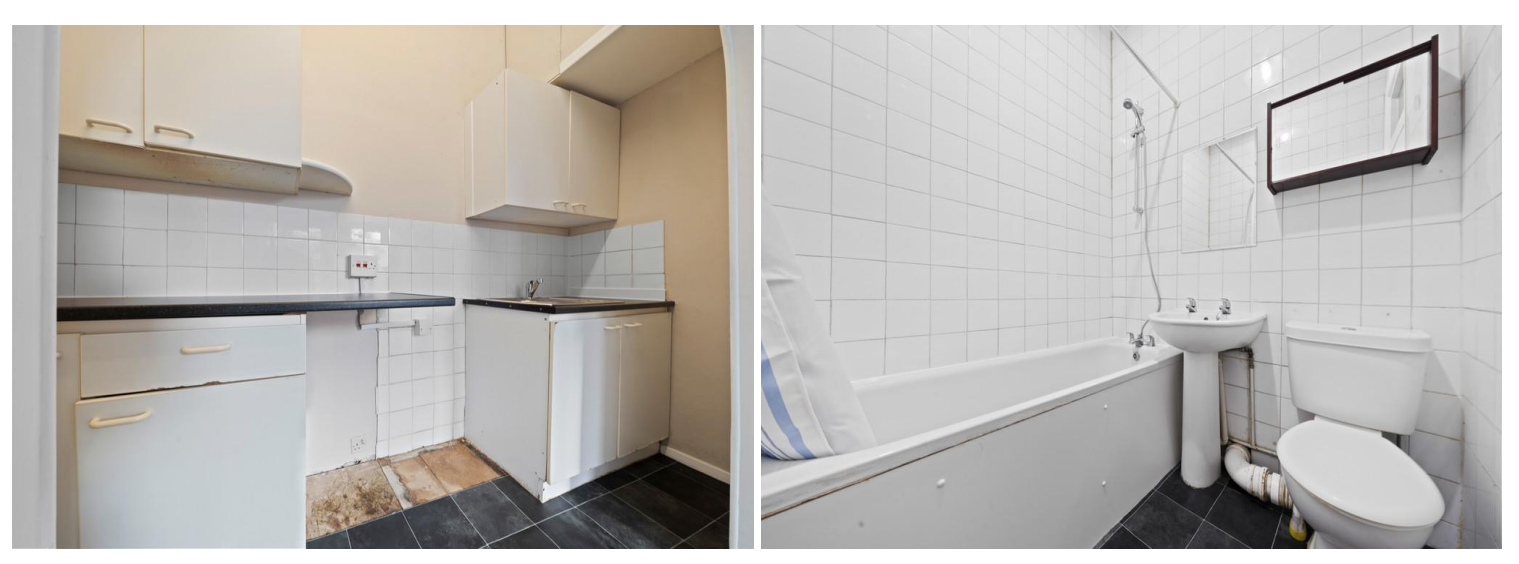
IMP ORTANT NOTE: Paul Graham have not tested any services, heating system, appliances, fixtures or fittings. References to the tenure of a property are based on information supplied by the seller as Paul Graham have not had sight of the title documents. Neither has Paul Graham checked any existing or necessary planning consents, building regul ations or rights of way. Prospective purchasers are advised to obtain verification from their solicitor or surveyor. PLEASE NOTE: All measurements are approximate and represent the maximum dimensions of any room (into bays and alcoves) and a margin of error should be allowed.