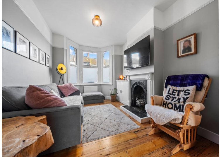
60 Beddington Grove, Wallington, Surrey, SM6 8LD | £529,000 Freehold

This attractive mid terrace family house is situated within a short walk of Mellows Park and a selection of excellent schools. The property boasts a wealth of character, and a viewing is advised. Wallington town centre is within walking distance and has a good range of shops and amenities. Wallington station offers rail links to London Bridge and London Victoria whilst local bus routes serve nearby Sutton and Croydon town centres.