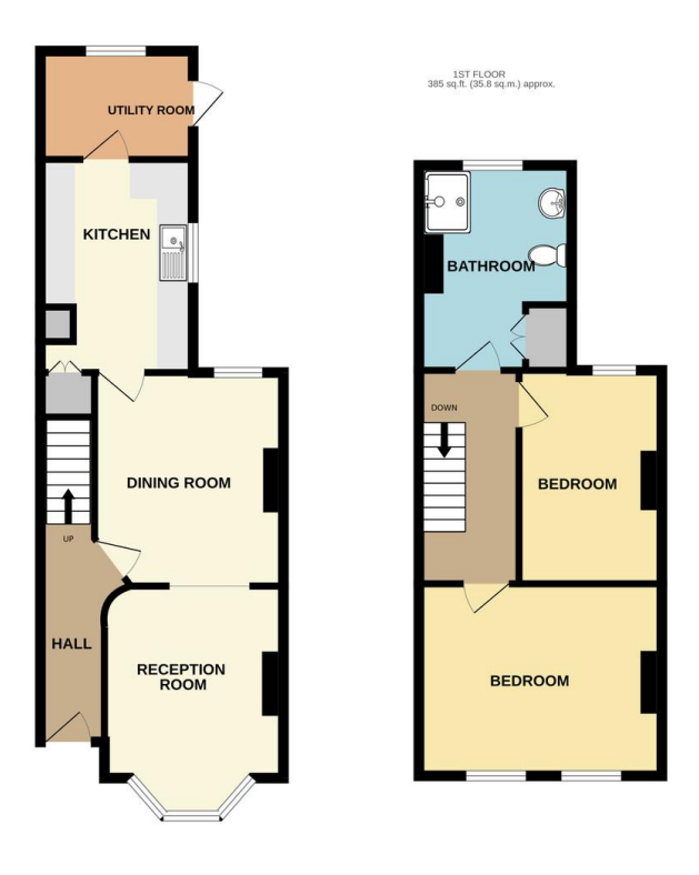
I O IAL HLOOK ARKEA: 852 Sq.M. (77.3 Sq.M.) approx. Whist every attempt has been made to ensure the accuracy of the Rooplan contained here, measurements of doors, windows, rooms and any other terms are approximate and no responsibility is taken for any error contistion or mis-statement. This plan is for illustrative purposes only and should be used as such by any