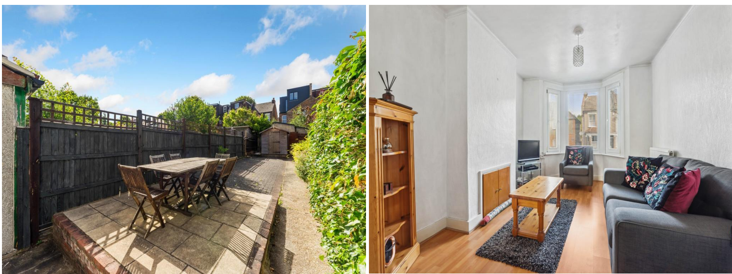
14 Tharp Road, Wallington, Surrey, SM6 8LE | £440,000 Freehold

Situated within a popular road close to Mellows Park, this Victorian terrace house is offered for sale with no chain. The property boasts 2 reception rooms, a fitted kitchen and a utility room on the ground floor. The first floor boasts two double bedrooms and a spacious bathroom. Wallington station and town centre are located within easy reach along with a range of reputable schools for most ages.