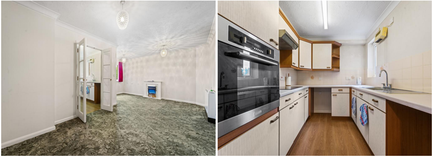
Flat 27 Marlborough Court, Cranley Gardens, Wallington, Surrey, SM6 9PG | £179,950

This larger than average 1st floor one bedroom apartment is located in Marlborough Court, a popular Over 60's development in Wallington close to local bus routes, a range of shops and amenities including the Jubilee medical centre. Facilities include a residents lounge, guest suite, communal laundry and communal gardens. No chain.