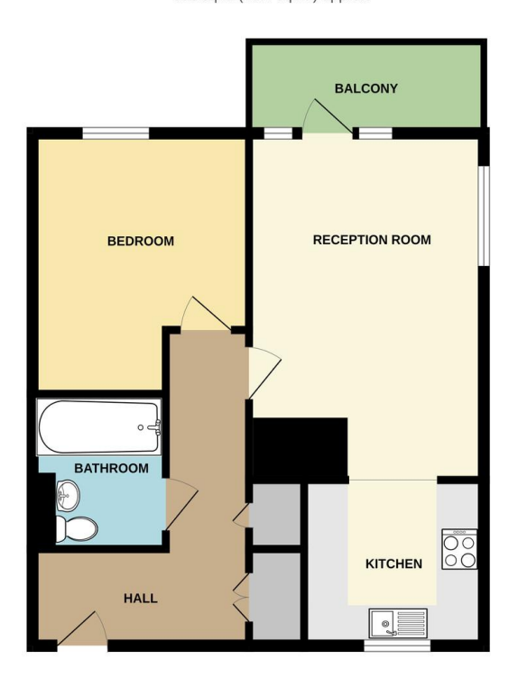
TOTAL FLOOR AREA: 532 s.g.ft. (49.4 s.g.m.) appriox. What every attempt has been made to ensure the accuracy of the floorpian contained teer, measurement of doors, instruer, come out may the tear the second of the floorpian contained teer, measurement of the plan is for illustrative purposes only and should be called as other than onession or mis-soarcent. This plan is for illustrative purposes only and should be used as such by any prospective purchaser. The services, systems and applicances shown have not been tested and no guarante as to their operability of efficiency, can be given.

4TH FLOOR 532 sq.ft. (49.4 sq.m.) approx.