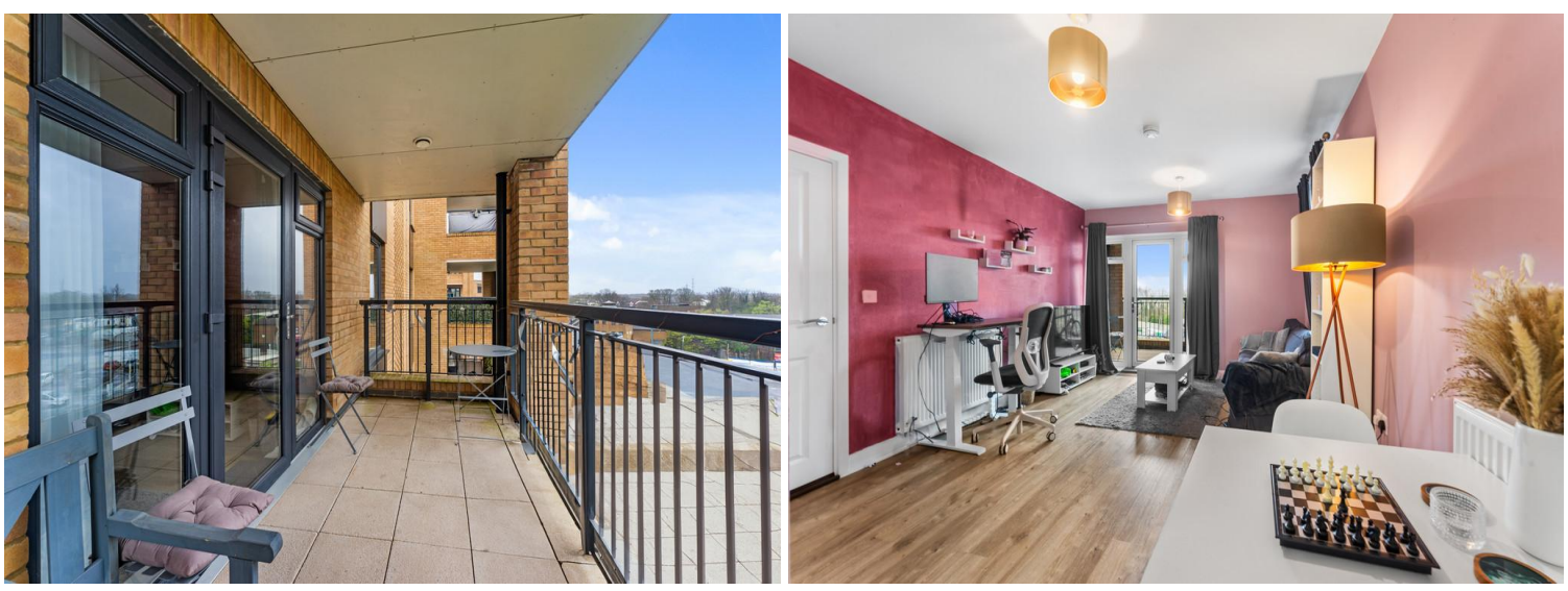
42 Pointelle House, 190 London Road, Hackbridge, Surrey, SM6 7FW | £295,000 Leasehold

Positioned in the popular New Mill Quarter development in Hackbridge, this one bedroom apartment is offered for sale with no chain. Located on the 4th floor the property the property boasts an open plan living area with doors onto the balcony, an open plan fitted kitchen, doubled bedroom and spacious bathroom. Other features include a long lease and an allocated underground parking space.