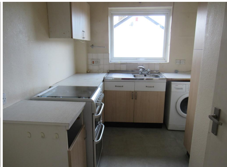
Flat 6 Glen House, 72 Bute Road, Wallington, Surrey, SM6 8BS | £190,000 Leasehold

This first floor apartment is located within a short distance of Wallington high street and station which offers routes to London Bridge and London Victoria. The property which does require some updating is offered for sale with no chain and boasts a spacious lounge/diner, double bedroom, 9'10 kitchen and bathroom. Other benefits include allocated parking. The property will benefit from an extended lease.