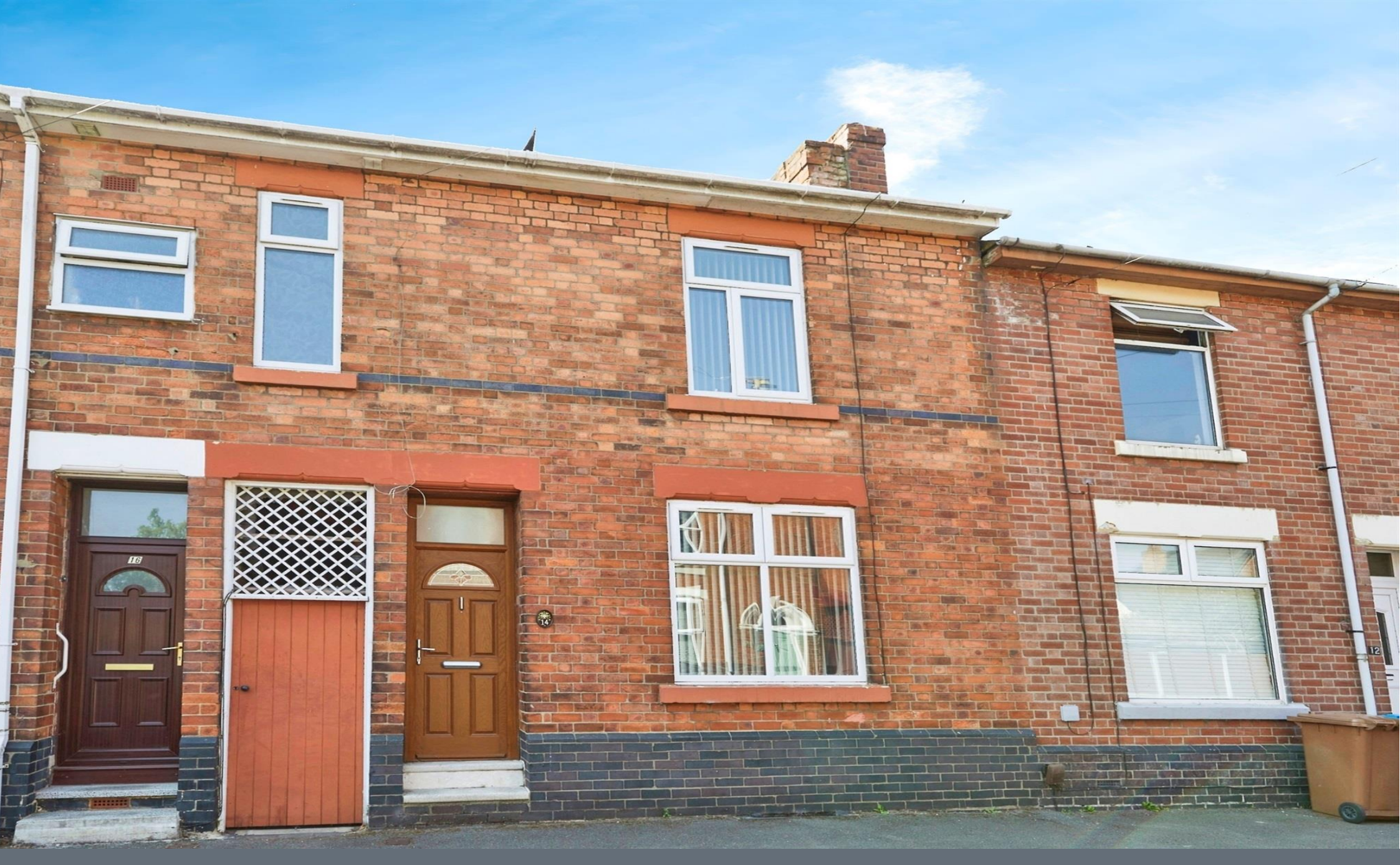
Murray Street Derby