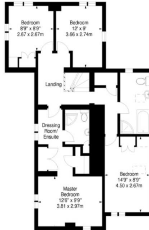
First Floor (79.80 M 2 )