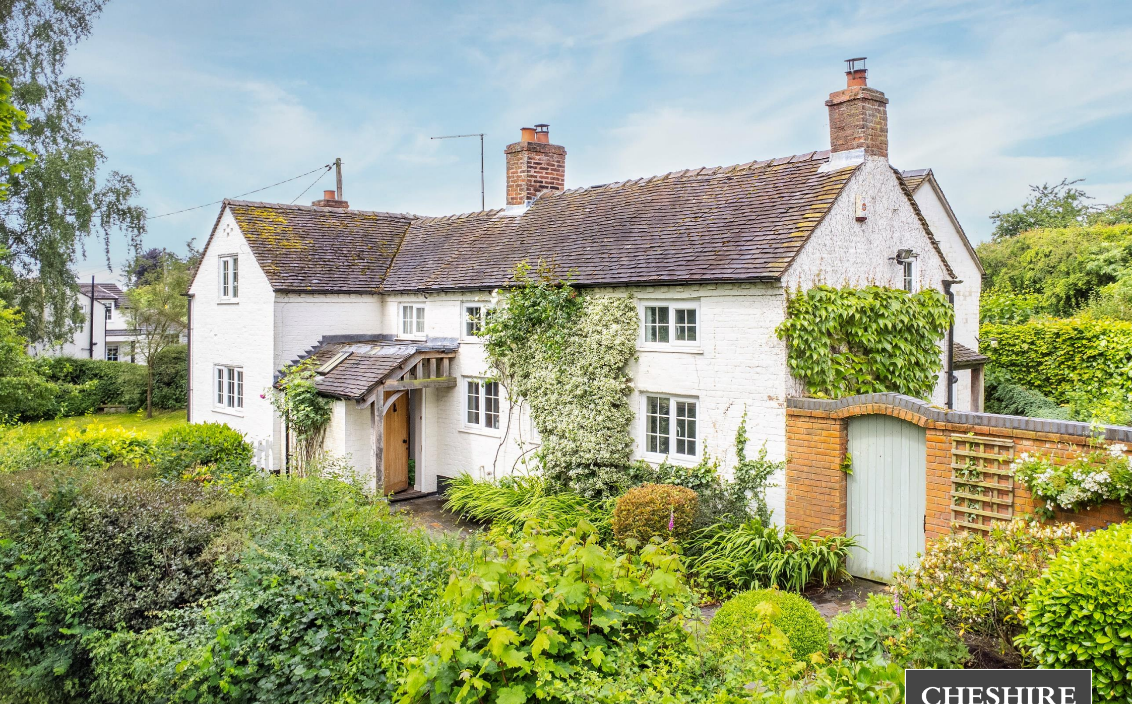
Green Lane Cottage, 22 Green Lane, Audlem CW3 0ES