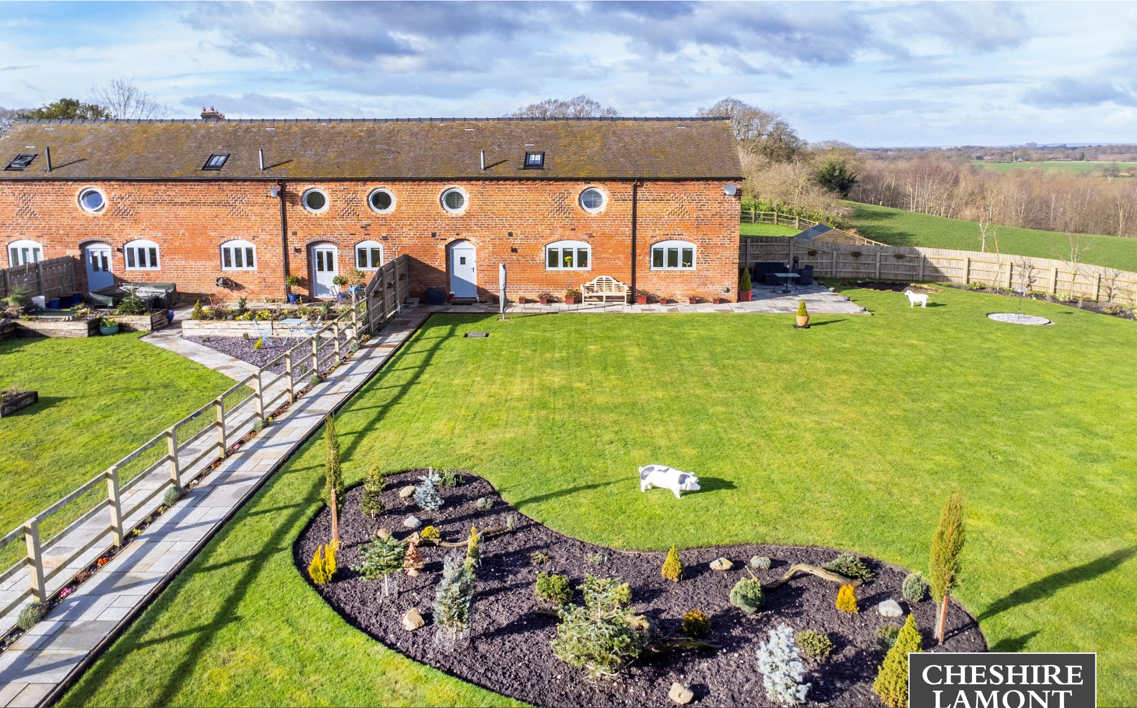
2 Town House Barns, Rushy Lane, Barthomley CW2 5PB